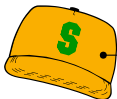
CAP W/ 1 LETTER Poly foam with mesh back (#39-165) $3.00